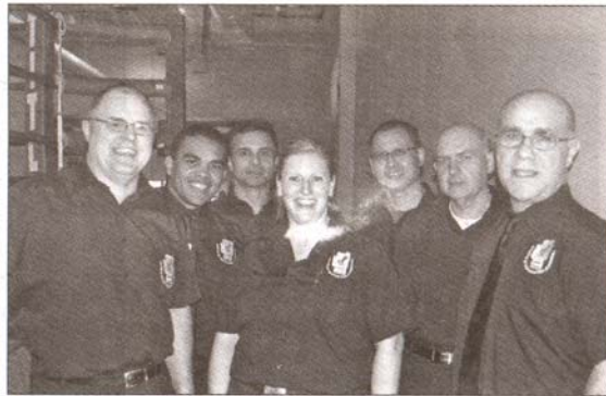
Officials from the event ready to keep control of the action