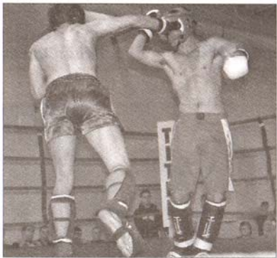
He'll feel that in the morning!